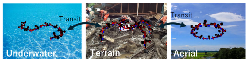
Figure 2 Meta-morphic Modular Robot that can perform multi-modal locomotion and manipulation.

We are developing a self-reconfigurable modular robot platform that can enable multi-modal locomotion and manipulation as shown in Fig2. A novel quadruped robot called SPIDAR [23] that can both walk and fly, is our preliminary achievement of this topic.